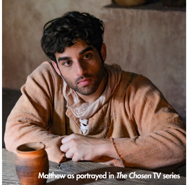
Matthew as portrayed in The Chosen TV series

Matthew was probably written in Palestine in the early church period when the audience was mainly Jews. Matthew was a tax collector before following Jesus. Matthew composed the Gospel in Greek around 70 A.D. He emphasizes the fulfillment of the Old Testament prophecies by Jesus Christ. Christ is a new law giver whose divine mission was confirmed by repeated miracles. Matthew traces the genealogy of Jesus back to Abraham. His gospel is directed to follow Jews trying to get their acceptance of Jesus as the Messiah. Matthew is claiming that Jesus is greater than Moses and Jesus isn't just another prophet or king but is the triune God who fulfilled the Old Testament prophecies. Jesus has conquered the power of death and [promises eternal life to his believers.] Matthew mentions 36 miracles performed by Jesus which are the most mean toned in all the gospels.